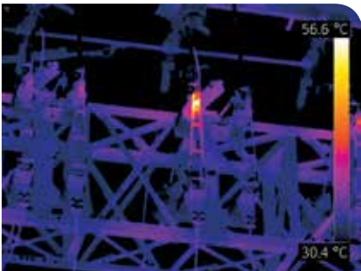
Overheating substation circuit breaker